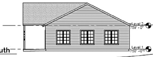
2 Lot C South 1/8" = 1'-0"