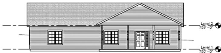
1 Lot C West 1/8" = 1'-0"

As The Arc Carroll County proudly celebrates its 70th anniversary in 2025, we are thrilled to launch Raise the Roof —a transformative fundraising campaign aimed at creating new opportunities for the individuals we serve with intellectual and developmental disabilities to enjoy community living. With your support, we can build two state-of-the-art, fully accessible homes, providing safe, comfortable, and empowering living spaces for six individuals.