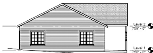
4 Lot C North 1/8" = 1'-0"

Our goal is ambitious yet vital: $1 million. This milestone will mark a giant leap forward in our mission to enhance the quality of life for our individuals and their families. These homes will be more than just buildings—they will be places of belonging, safety, and joy.